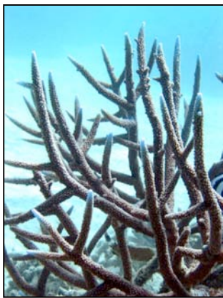
Healthy branching hard coral at Vale Vale Conservation Area, Pango village.