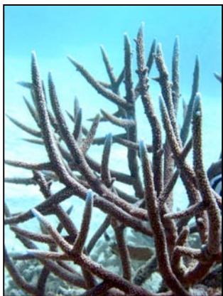
Healthy branching hard coral at Vale Vale Conservation Area, Pango village.