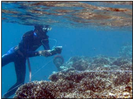
Practice Reef Check survey at Vale Vale Conservation Area, Pango Village.

Participants were trained to conduct Reef Check surveys on snorkel, how to present their data to local communities and how to use Reef Check as a tool to establish and manage community marine protected areas.