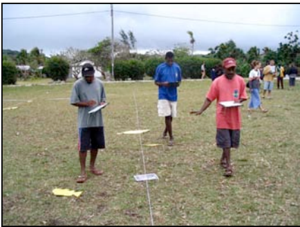
Workshop participants practicing the fish survey in Pango Village.